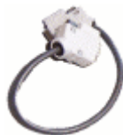
2 Serial Cables